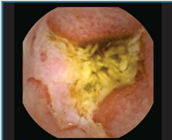
This picture shows a capsule image of Crohn's disease. A discrete whitish ulcer can easily be seen by the physicians of Stony Brook Internists using capsule endoscopy.