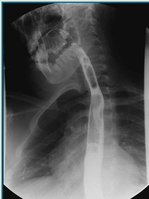
Video Swallowing Study